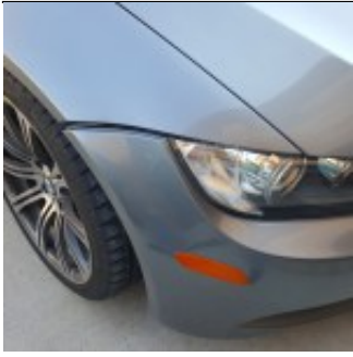
bumper pulled lose