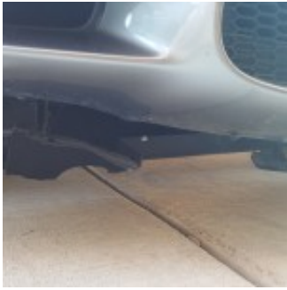
lower air damn broken