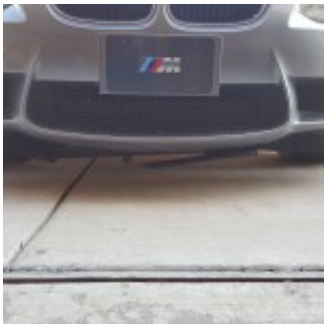
caused because wheel lift not lowered to ground

These damage photos are exactly the reason that a vehicle owner while inside the fence at Atlas' Storage Lot after paying and before leaving, check their vehicle for damage . If you discover damage, call SAPD at 210-207-7273 to request an officer arrive at the storage facility for an information and/or damage report with their tow company liability policy number.