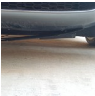
underside of bumper scraped

Another issue, with regards to complaints of vehicle owners after their vehicle being towed by these thieves, is damage to their vehicles, that weren't there prior to being towed.