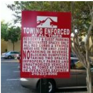
Illegal Tow Sign, File for Tow Hearing and file TDLR complaints if towed with these signs posted.

Below is what a legally worded tow sign must look like, as you can see it doesn't have added words as Atlas' illegal tow signs above.